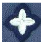
1st Class Cadet

And, that all officers in the ATC hold the Queens commission and although highly unlikely, in theory at least could be called to serve in the RAF in times of war.